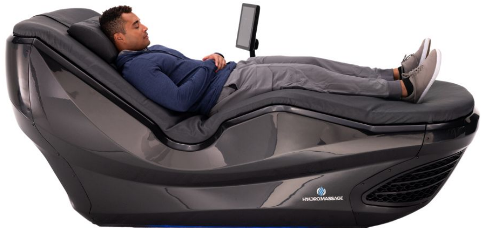
HydroMassage 440 G3